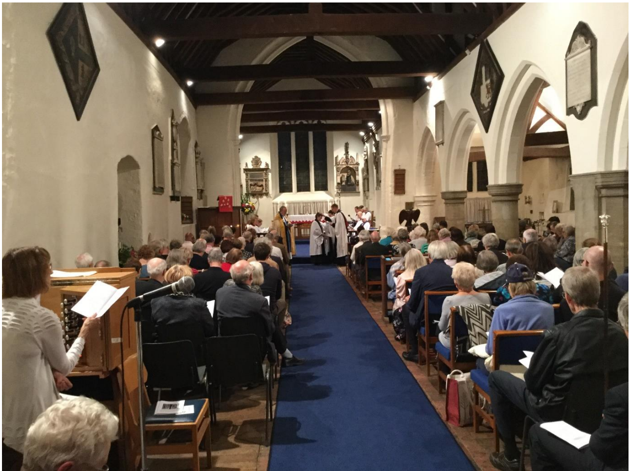
All Saints during the licencing of the Revd Hilary Musker, September 2018