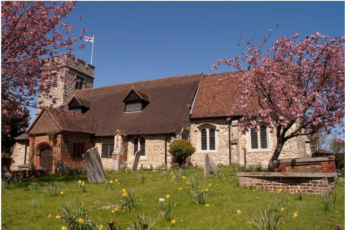
All Saints from the south