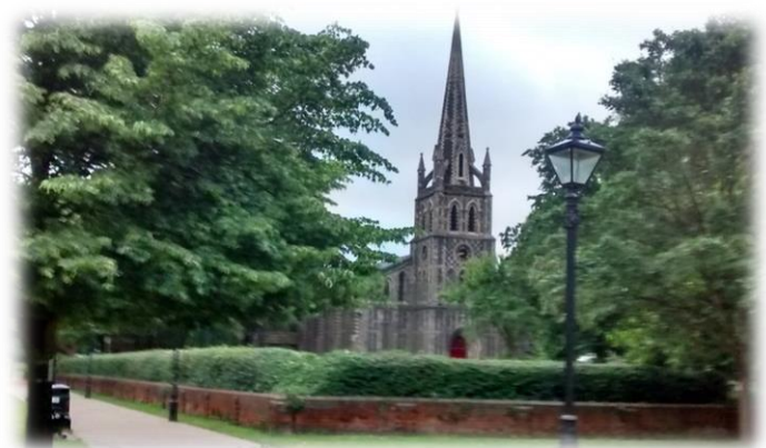
Two views of Ss Peter & Paul: from the south east (left) and from the north west (right)