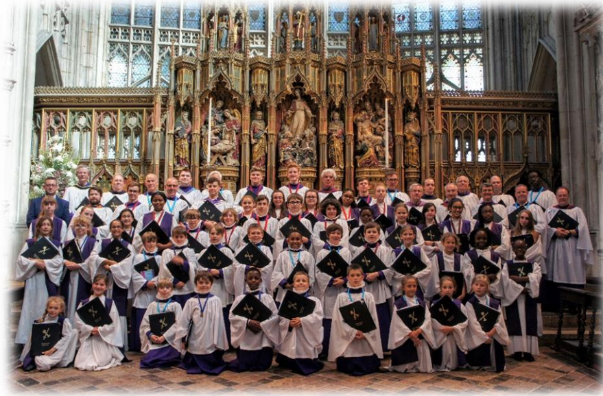
The boys, girls and men of the Choir at the end of their week in Gloucester Cathedral, August 2018

Many people connect with the churches through the different choirs and many families have become members of the church community through that initial contact. Enthusiasm and encouragement for this tradition, particularly as a vital form of outreach, will be an essential in the new Rector.