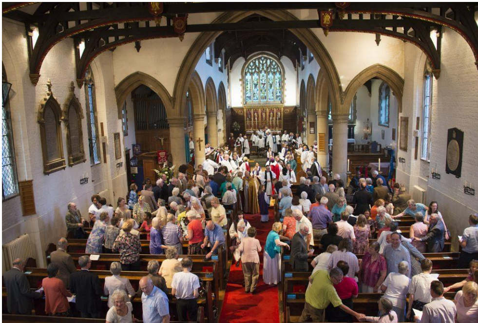
A service at Ss Peter & Paul