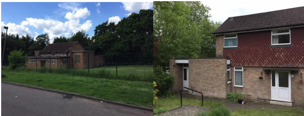
(Left) The former church of St Francis