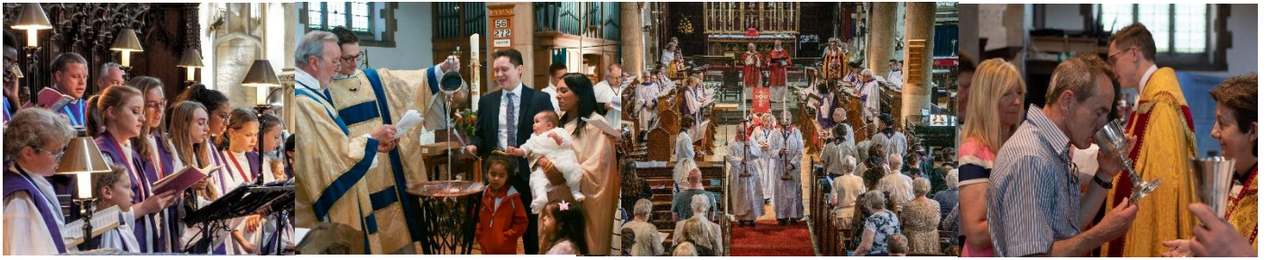
A few photos of worship at Ss Peter & Paul