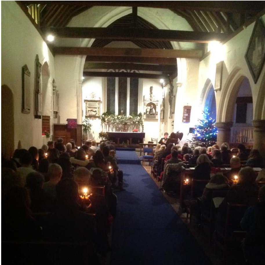
Christmas at All Saints