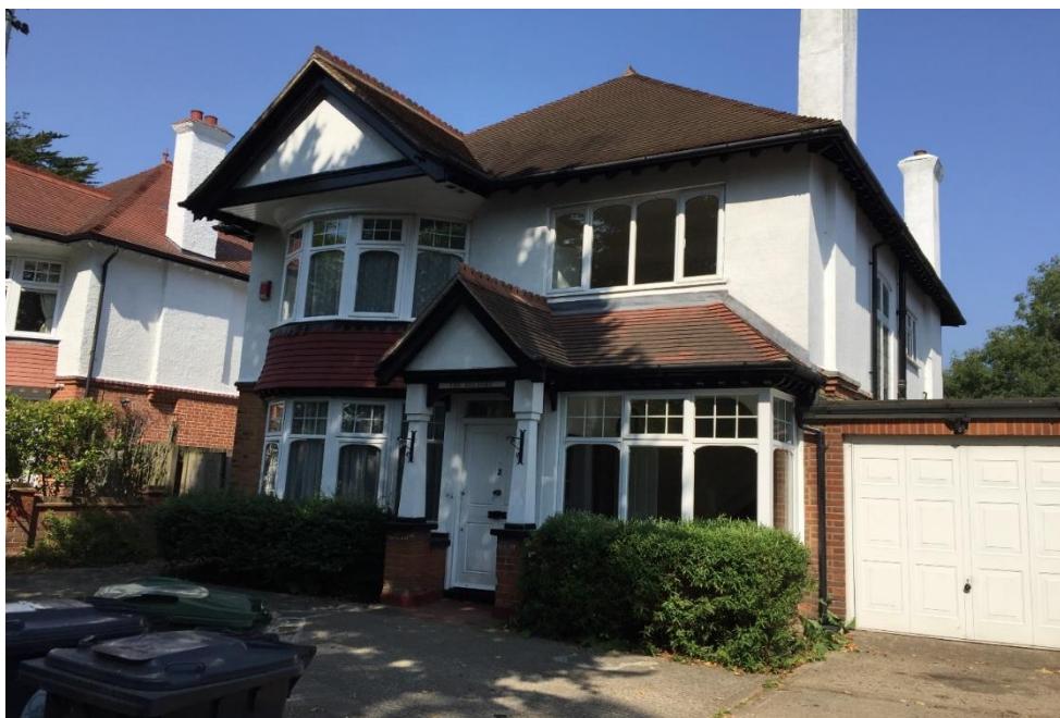
The Rectory from The Green Walk

The Rectory is at 2, The Green Walk, Chingford, E4 7ER, one minute's brisk walk from Ss Peter & Paul. Located near the entrance in a long cul de sac , it is a 1920s detached house with four bedrooms and a large rear garden, currently grassed over. Please see Appendix 7 for more detail about the Rectory and about some of what Chingford has to offer as a place to live and work.